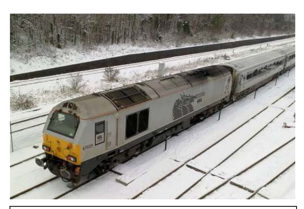
EWS Company loco 67029 at Wembley Depot at the head of a WSMR train 20th Dec 2010.